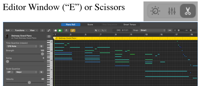
Editor Window (“E”) or Scissors