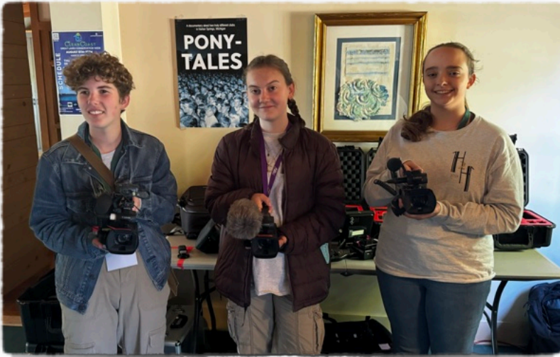
Our camera crew is ready to head into the tunnels of the Manitou! (upper-left) The scene is set, cameras are rolling and we're about to start filming! (upper-right)